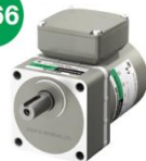
Induction Motor Terminal Box Type